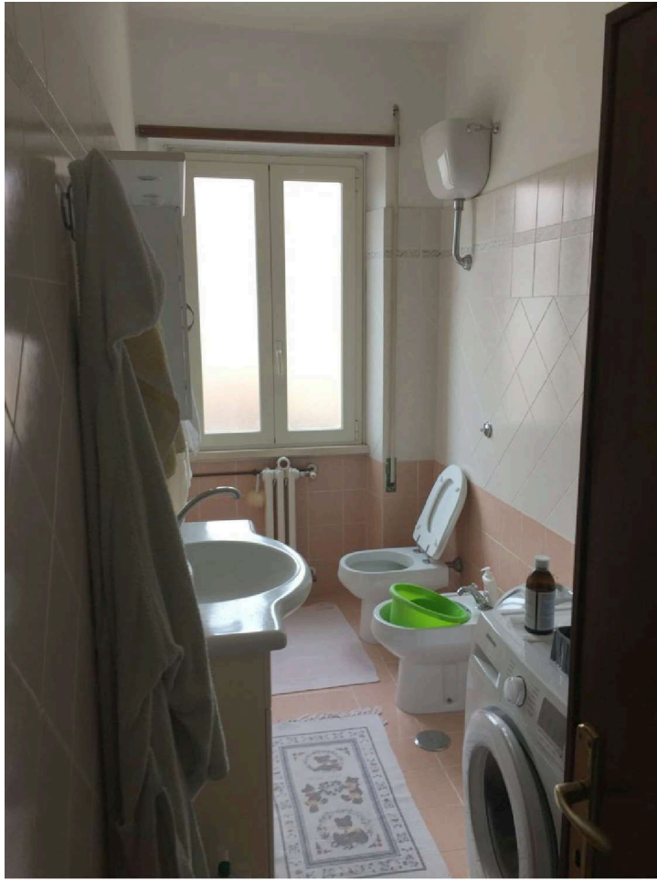
ENSN M 66 KUhs` A`f nm