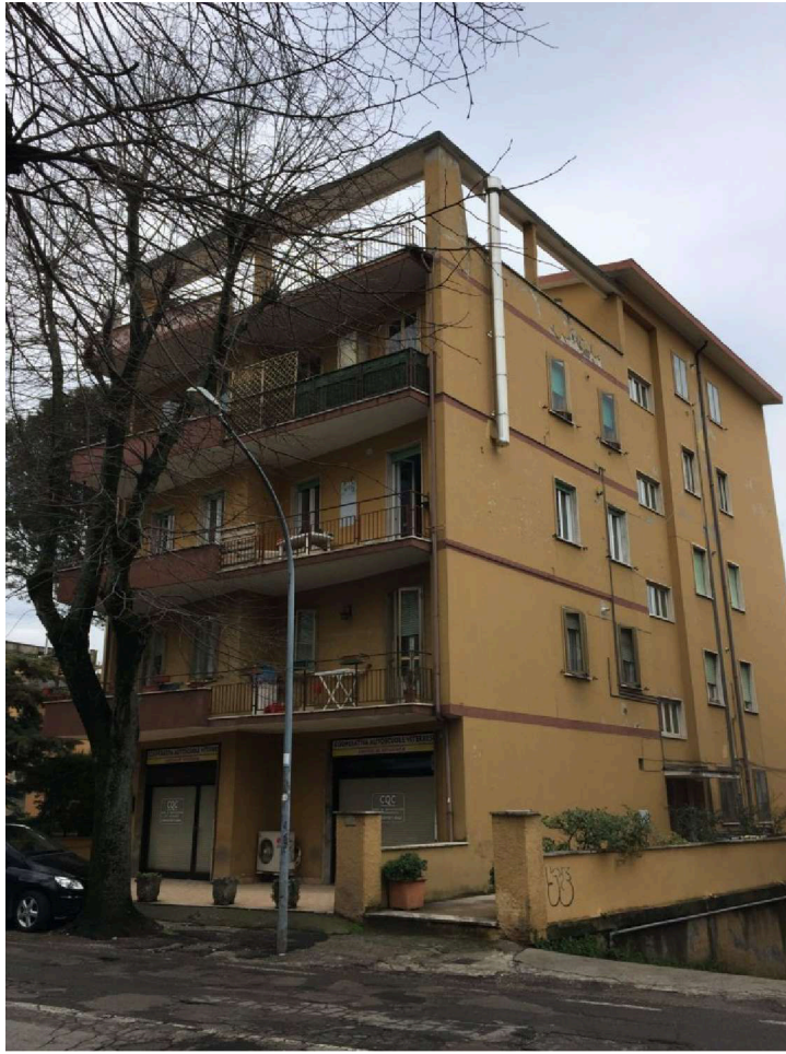
ENSN M&O KUhrs` Drsdqm`