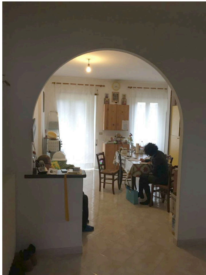
ENSN M07 KUhrs` Bt bhm`