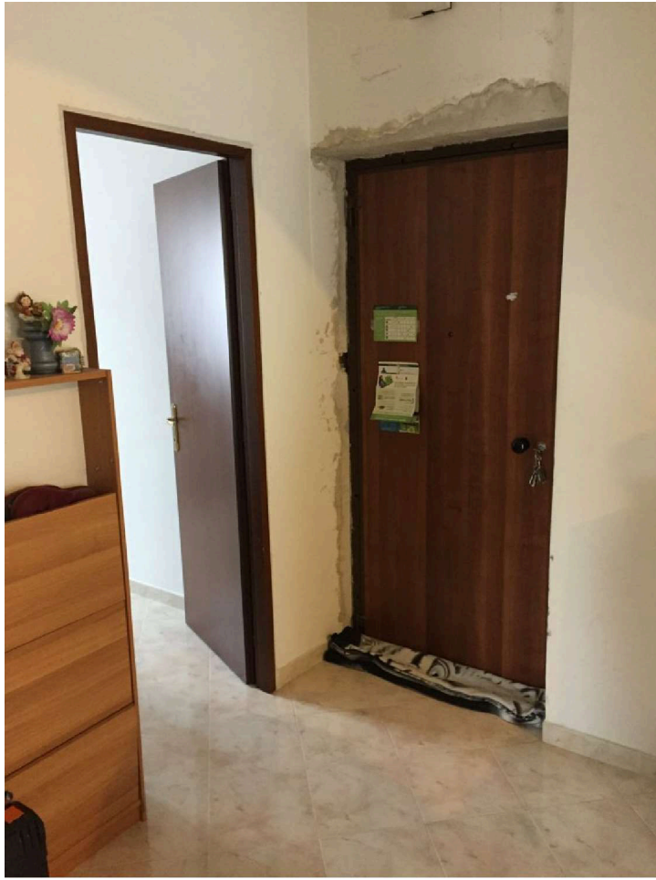
ENSN M 08 KUhs` Dmsq`s`