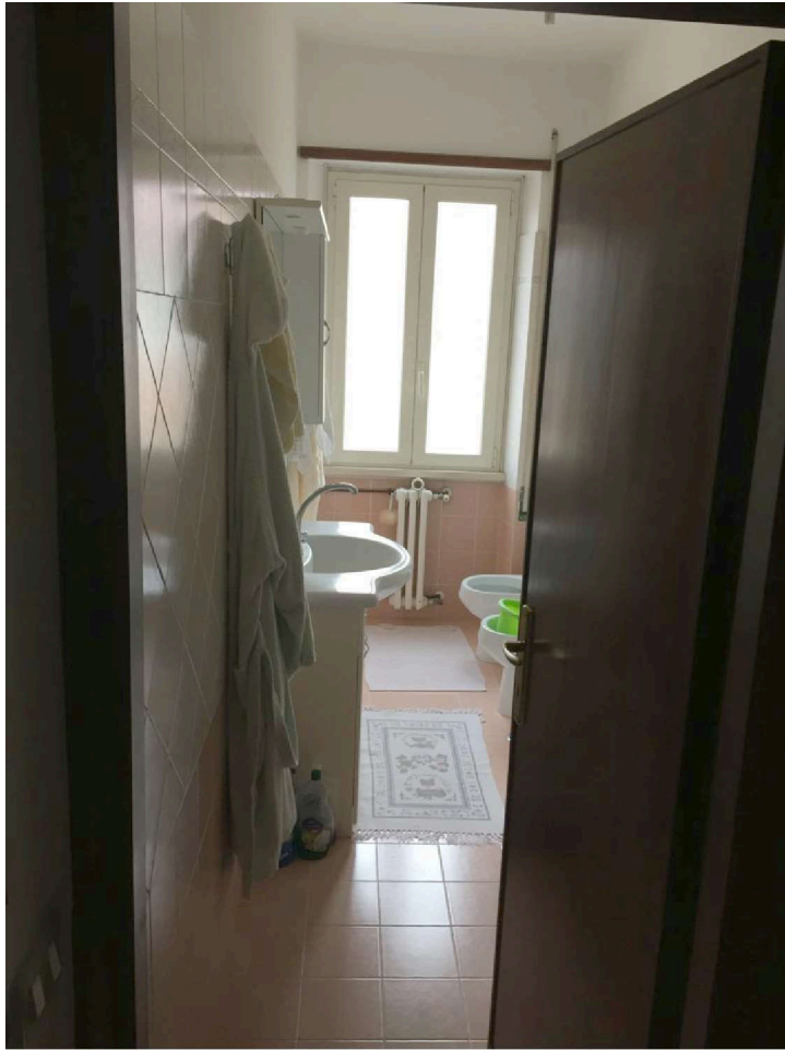
ENSN M 4 KUhs` A`f m