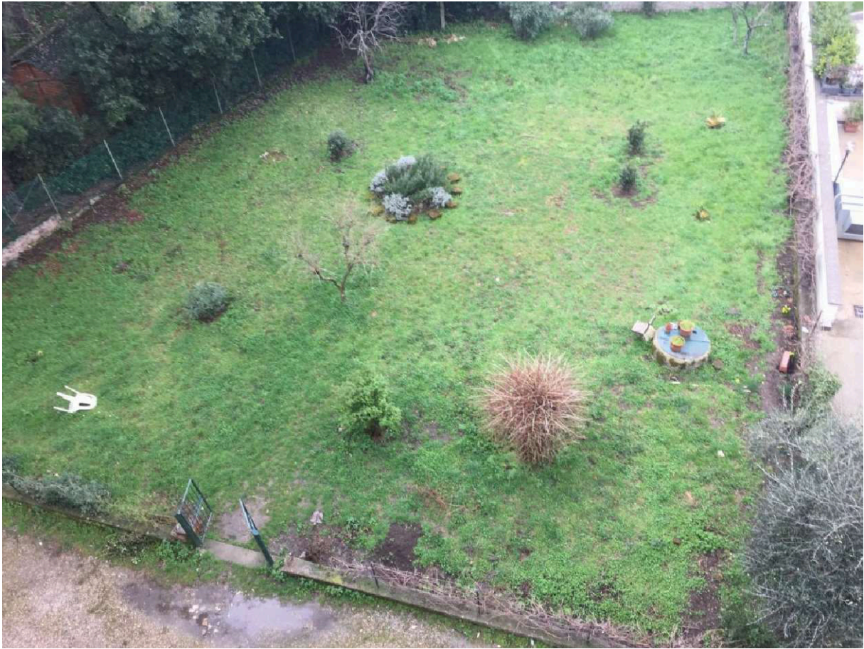
ENSN M06 KUhrs` F h`qhm