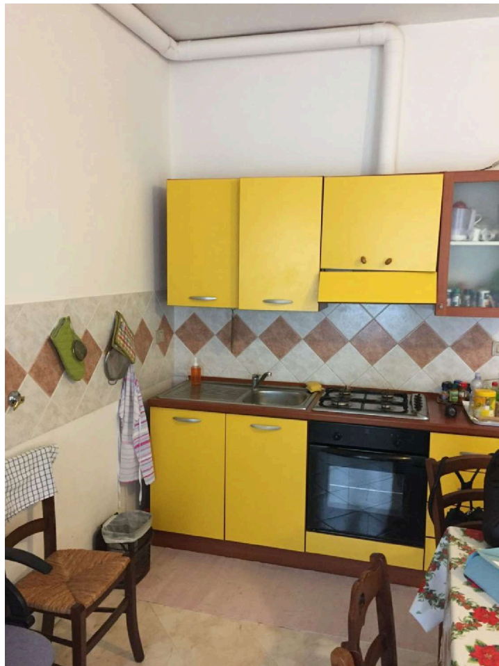
ENSN Ma03 KUhrs` Bt bhm`